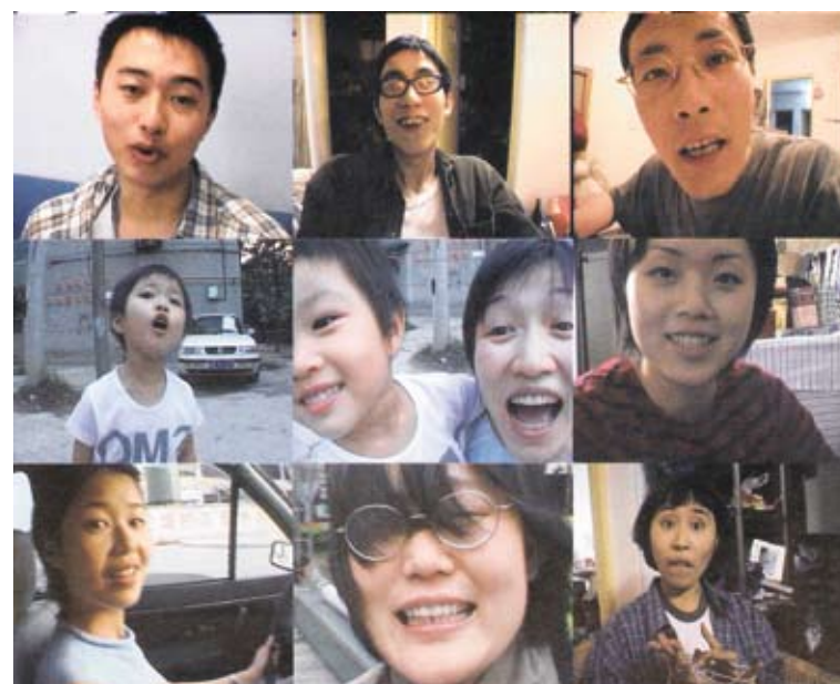
Everybody dies: Yang Zhenzhong's film is simple and terrifying