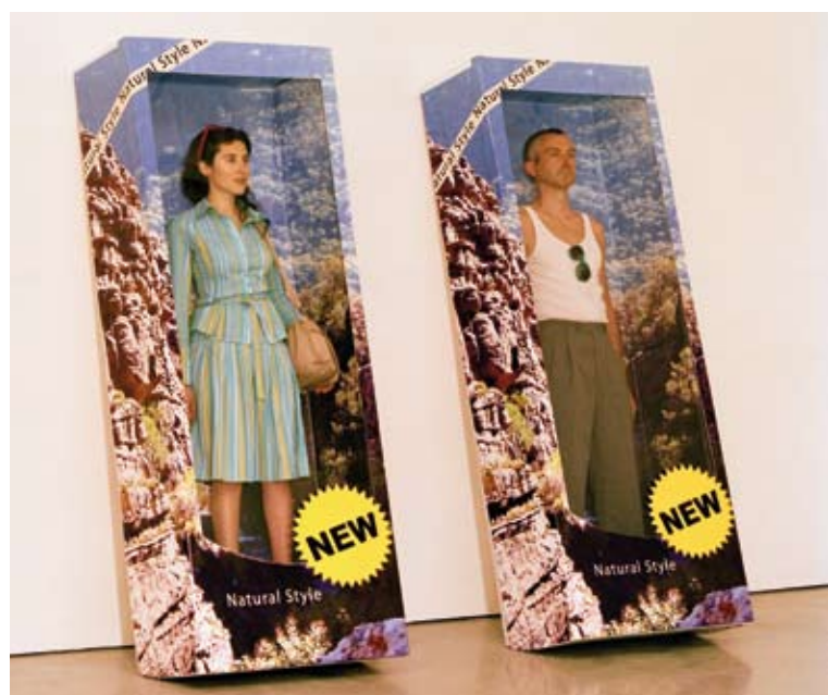
Boy and Girls: appropriate gender presentations